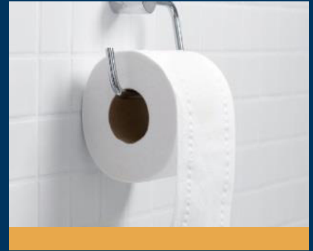
Consumables – Including hand towels, soap and air fresheners