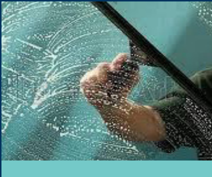
Window Cleaning – Interior and exterior