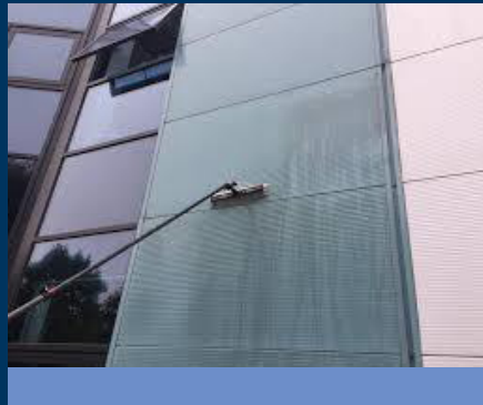
Exterior Building Cleans – Cladding, brickwork and pavements