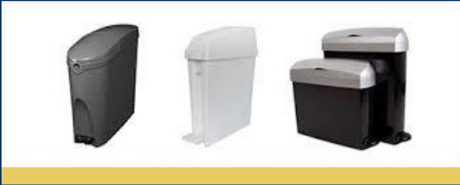
Hygiene Services – Sanitary Bins and collection. Air Fresheners etc